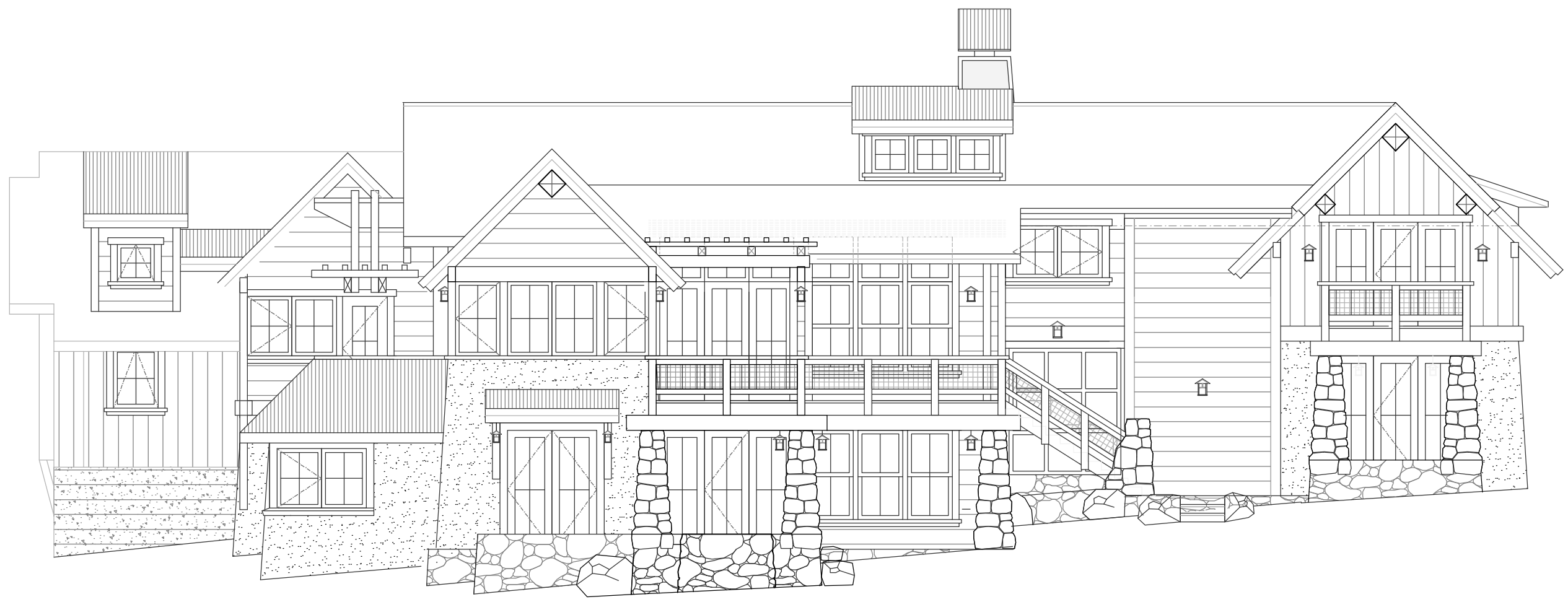
SOUTH (REAR) ELEVATION