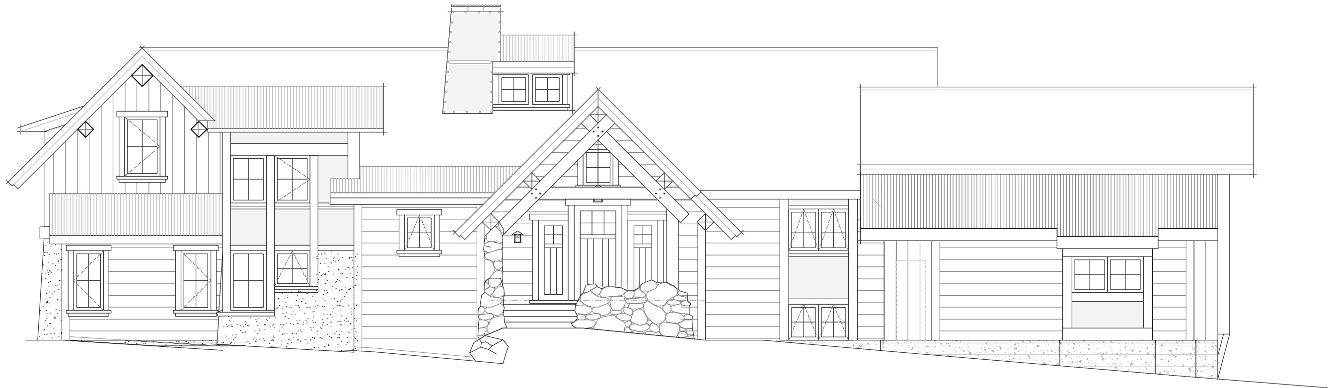
NORTH (FRONT) ELEVATION